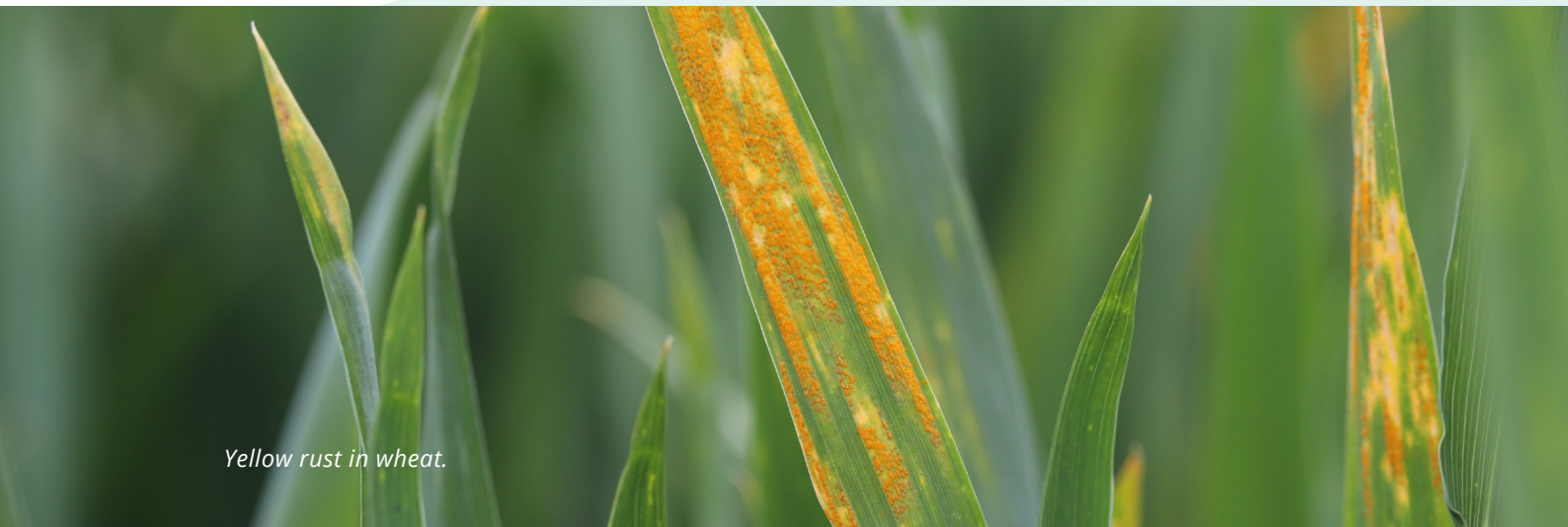
Yellow rust in wheat.

Yellow rust ( Puccinia striiformis ) is known to attack wheat. Fungicide treatments may need to be applied between end of tillering (GS 29) and beginning of grain filling (GS 71) to protect leaves from attack of yellow rust and yield losses.