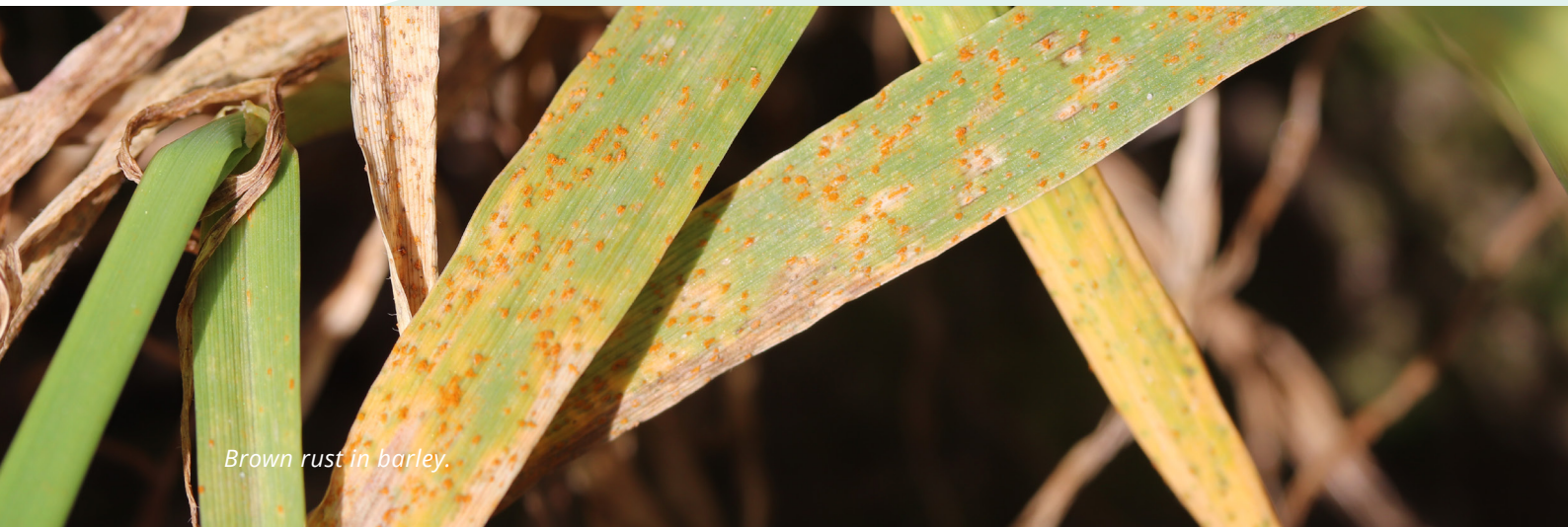
Brown rust in barley.

Brown rust ( Puccinia hordei ) is known to attack barley. Fungicide treatments may need to be applied between start of elongation (GS 30) and full flowering (GS 65), to protect leaves from attack of brown rust and yield losses.