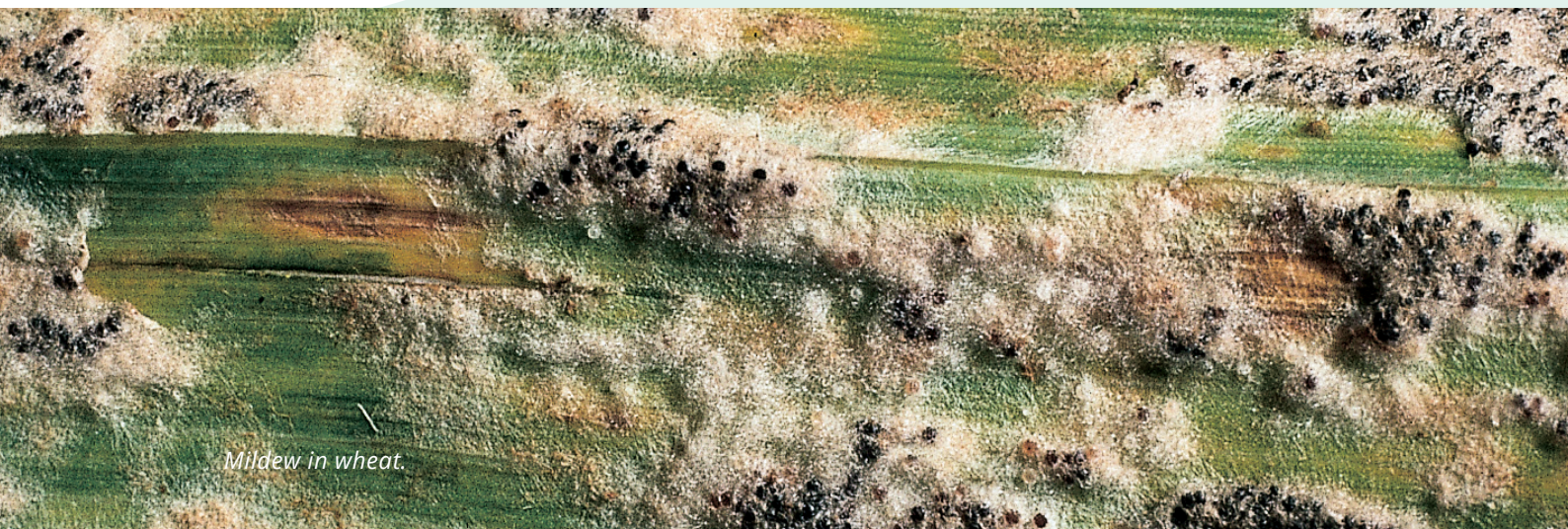
Mildew in wheat.

Powdery mildew ( Blumeria graminis ) is known to attack wheat. Fungicide treatments may need to be applied between late tillering (GS 29) and before heading (GS 40), to protect leaves from attack of powdery mildew and yield losses.